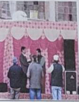
Dharampur honoring to Principal Sir