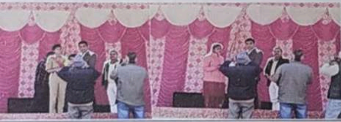
College Student getting prize from SDM Dharampur