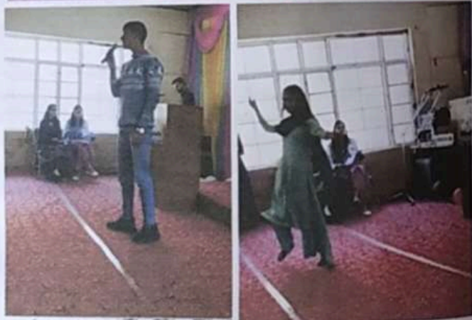
Solo Singing Competition —