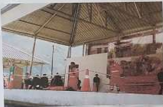
NDRF Activity of the session 2022-23