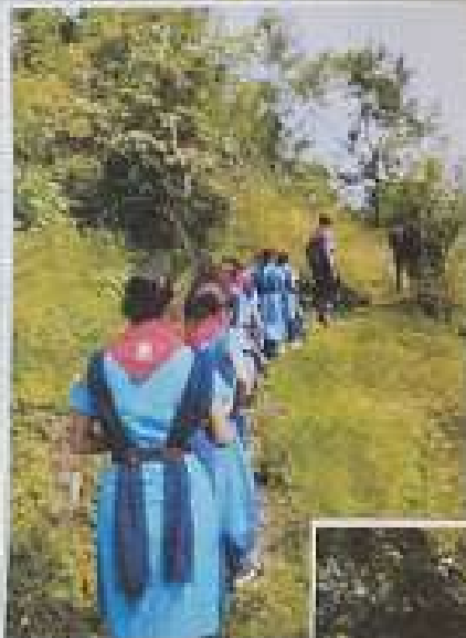
Revert a Rauger GDC, Shamarpur, Meadi