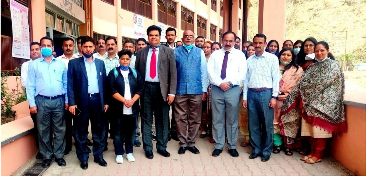
COLLEGE STAFF WITH NAAC PEER TEAM MEMBERS, MARCH 19, 2021